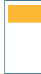
1/4 PAGE (H)